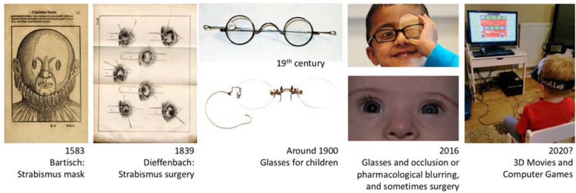
Fig. 3 In 1583, Bartisch documented the first conservative treatment of strabismus; in 1839, Dieffenbach first published a surgical method. Glasses for children were introduced at the end of the 19th century (images of spectacles courtesy of the College of Optometrists, London). Current amblyopia treatment includes glasses, occlusion or pharmacological blurring of the better-seeing eye (atropine paralysis of the ciliary muscle/accommodation, with dilation of the pupil as associated effect), and occasionally strabismus surgery. Future treatment may involve binocular strategies balancing the input from the two eyes to the visual cortex.