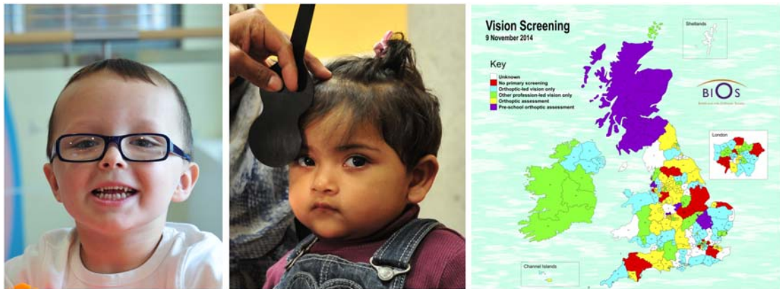
Fig. 1 Children with amblyopia can have straight eyes (left, anisometropic amblyopia), strabismus (strabismic amblyopia) or both. Small degrees of strabismus can go unnoticed and may only be discovered by orthoptic assessment (centre). In the UK, commissioning of vision screening at primary school entry is variable (right); commissioning in England has recently changed from Clinical Commissioning Groups to Local Authorities, resulting in boundary changes and further development of local protocols. An updated map is currently in preparation. Purple: pre-school orthoptic-led and delivered with orthoptic assessment, pre-school in community clinics; yellow: orthoptic-led and delivered with orthoptic assessment, in school at age 4–5 years; blue: orthoptic-led, other profession delivered, visual acuity assessment in school at age 4–5 years; green: other profession-led and delivered, visual acuity assessment only in school at age 4–5 years; blue: orthoptic-led visual acuity assessment only; red: no primary screening commissioned; white: unknown, no response to British and Irish Orthoptic Society questionnaire